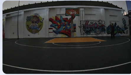
* Without supplemental light